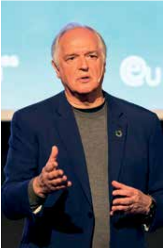
Paul Polman CEO Unilever (2009-2019) and Co-Author of Net Positive

EU Business School regularly invites some of the world's most eminent leaders to share their expertise with students.